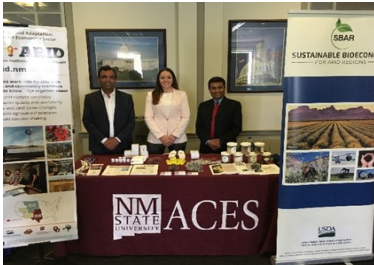
SBAR presents at US Congressional Research Exhibit in Washington DC

Available March 2020. Contact: Trent Teegerstrom (520) 621-6245 or tteegers@email.arizona.edu