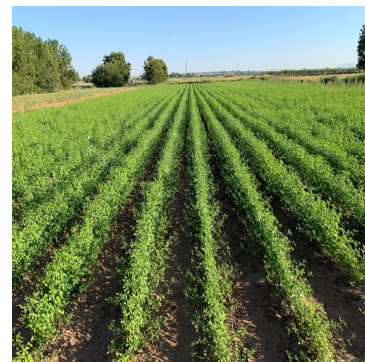
> Guar trial in Los Lunas, NM, August 2019

We continue to share information about SBAR at agricultural meetings and events in both New Mexico and Arizona, we are always happy to visit with you if you have any questions.