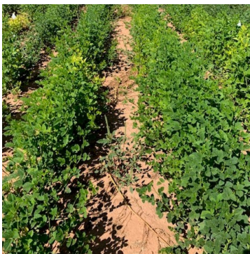
< Guar trial in Tucumcari, NM, August 2019

Therefore, in 2019, the study was changed to include testing different rates of nitrogen and phosphorus together at four sites in NM. These sites were Leyendecker Plant Science Center, Los Lunas Ag. Science Center, Clovis Ag. Science Center, and Tucumcari Ag. Science Center. These trials have been harvested from the field and we are still processing the different treatments to evaluate the final yields. Results will be shared as soon as they are available.